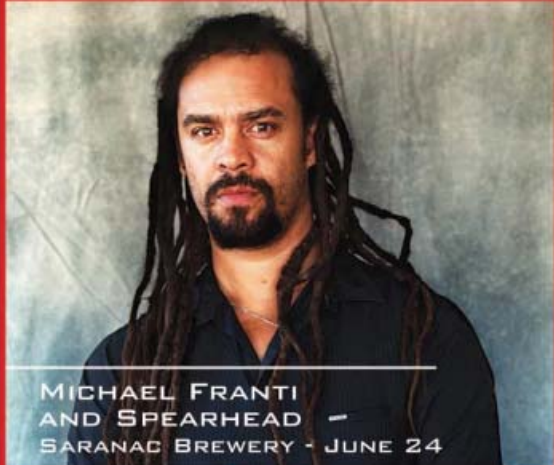
MICHAEL FRANTI AND SPEARHEAD - SARANAC BREWERY - JUNE 24