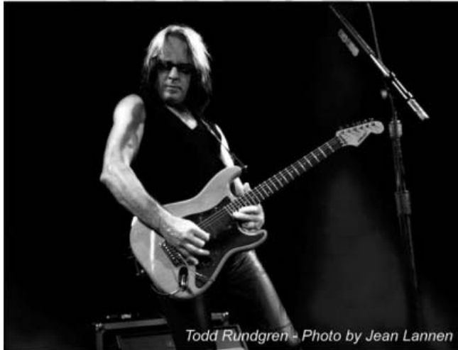
Todd Rundgren